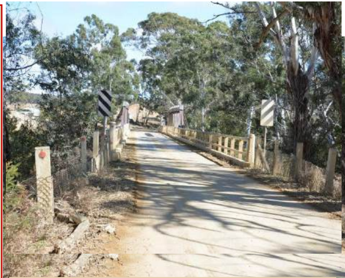
Charleyong Bridge- served the Nerriga Road from 1901 to 2019. The timber bridge style is known as an Allen Truss.