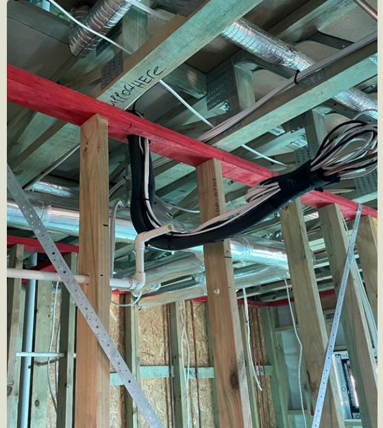
Wiring & drainage for air conditioning in accommodation ready for wall cladding.