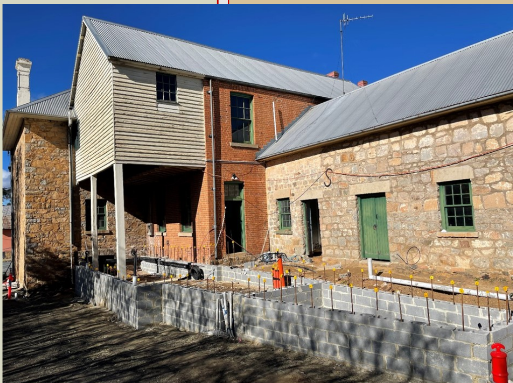
New entrance to the museum under construction