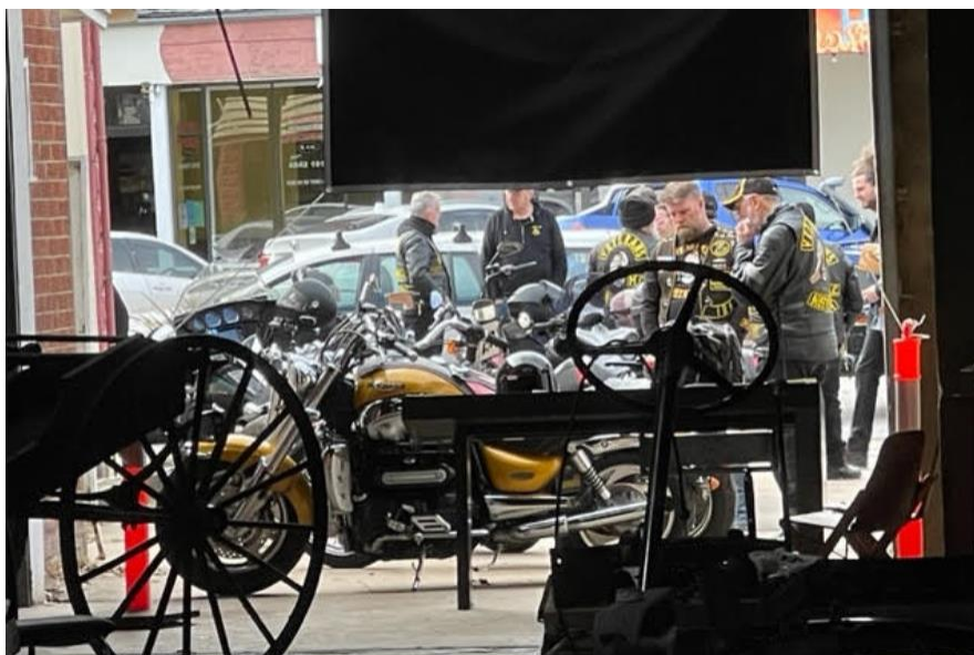
A visit from the ACT chapter of the Vietnam Veterans Motorcycle Club