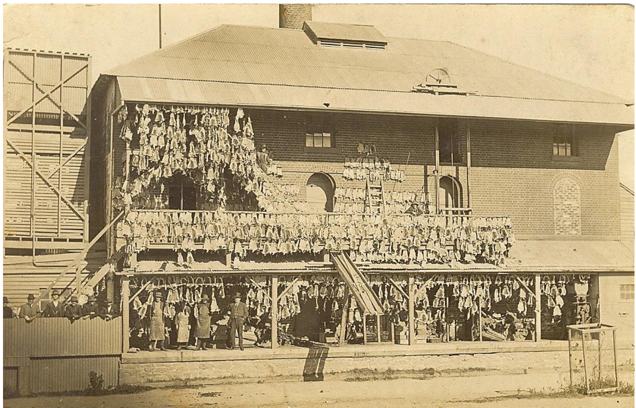
Braidwood Refrigerating Company in Duncan Street.